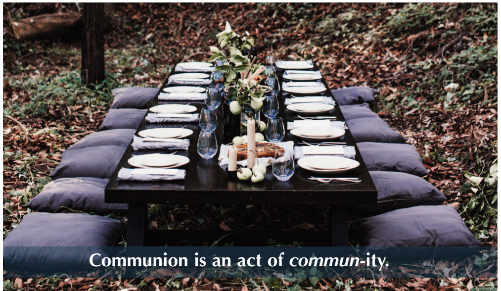
Communion is an act of commun-ity .

The essence of communion is a symbolic spiritual meal. Communion refers to uniting, being in union with Jesus and with one another—communion